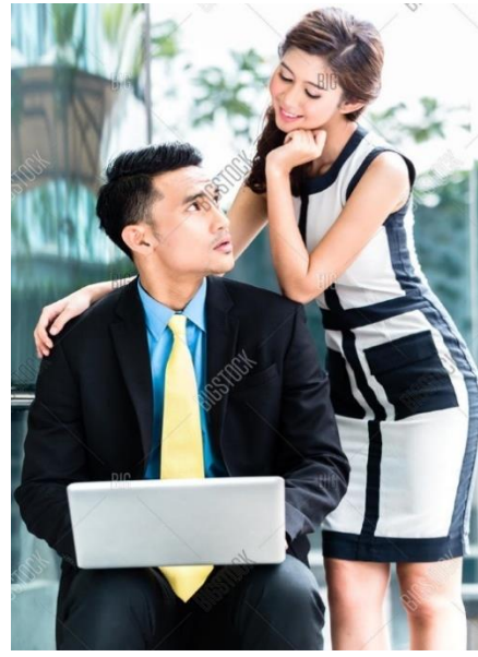
v. 7 after a time his master's wife cast her eyes on Joseph and said, "Lie with me"

This is NOT a STORY of ROMANCE it is an ASSAULT in the Workplace Never told Joseph is ATTRACTED – Don't know HOW She Looks! Or Name!? SUPERIOR is THREATENING a SUBORDINATE with Office RAPE