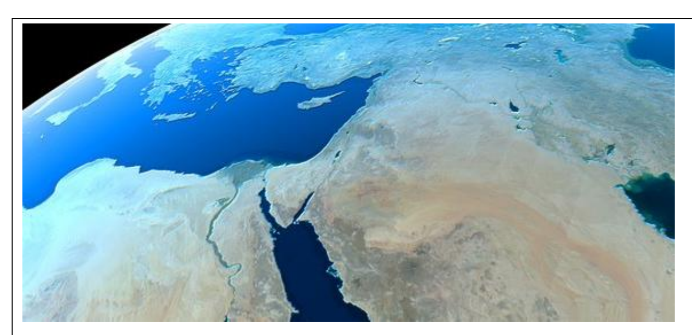
The LORD appeared to Abram and said, "To your offspring I will give this land." Genesis 12.7

The earth is the LORD's and the fullness thereof the world and those who dwell therein Psalm 24.1